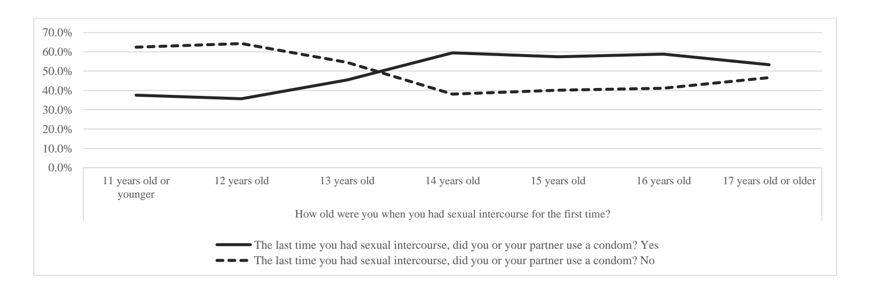
Figure 4-1. Relationship Between Age at First Sexual Intercourse and Current Condom Use.

Table note: data presented in total counts (n) and percentages (%) of total survey participants.